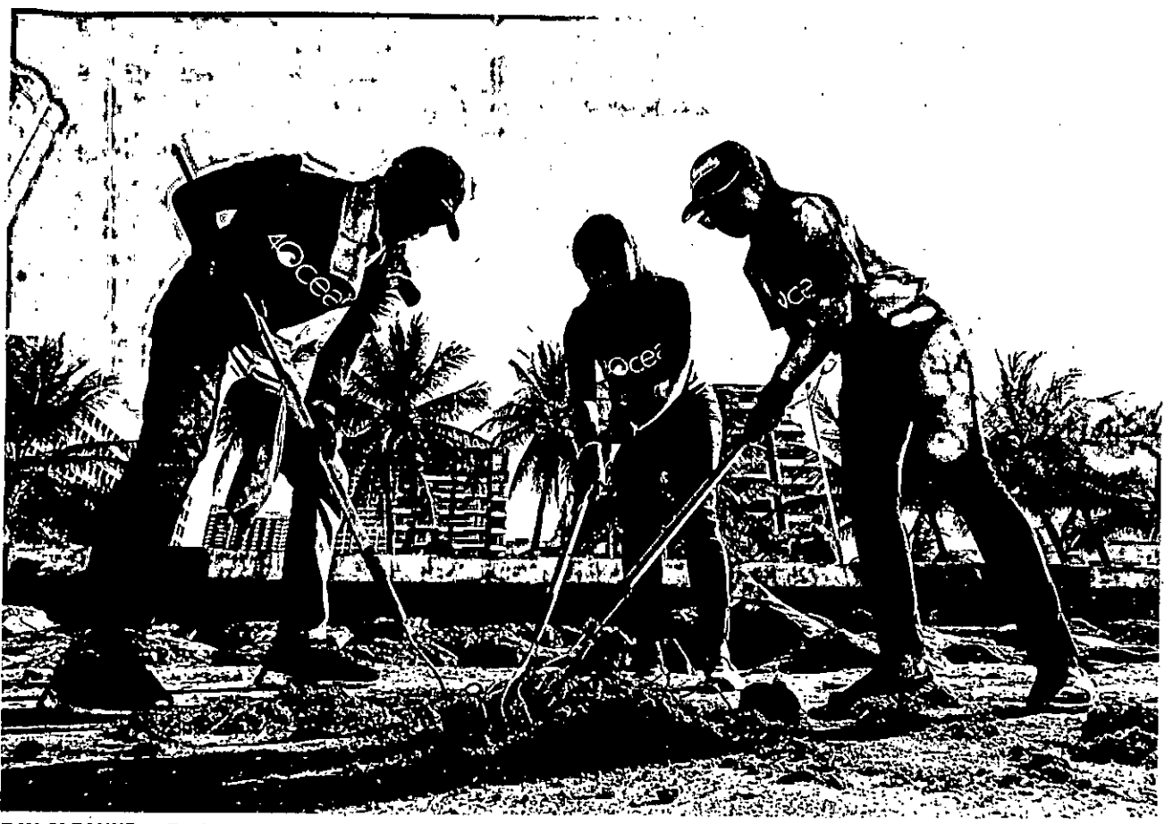
BAY CLEANUP — Environment advocates conduct a cleanup drive along the shores of Manila Bay yesterday. (Jansen Romero)

STRATEGIC COMMUNICATION AND INITIATIVES SERVICE